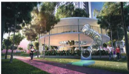
▲ Jogging Track Complement your fitness routine with a jog on a 2.7km path that weaves around the Relaxation Pavilion for your peace of mind.

With so many activities nestled around the area, there's always something around the corner to get you moving. From active to passive, indoor to outdoor, each recreational outlet comes with premium equipment designed to enhance the body, mind and soul. Your biggest challenge is which of the 70 activities will you decide to tackle today.