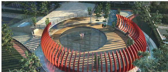
▲ Aqua Reflexology Experience our one of a kind Relaxation Pavilion that comes complete with the Aqua Reflexology pond that's 16m in diameter, to take away your stress, so you can enjoy a better quality of life.